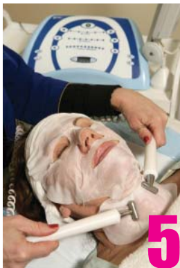
5 APPLY MASK biological derma mask to be applied after gel is removed. Micro currents help the mask's active ingredients penetrate deep into the skin time: 10-20 min