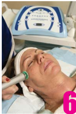
6 LUMO LED LIGHT proven, non-invasive facelift therapy. Absorbed using four types of light. time: up to 20 min • Red energises and promotes skin circulation • Green enhances facial muscle tone and fullness • Yellow treats saggy skin • Violet provides overall healing for damaged skin