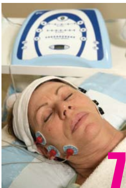
7 STIMULATE lymphatic system or muscles, depending skin's condition time: 15-20 min